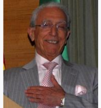
Prof. Dr. Madjid Samii Conceptualized & Presented by